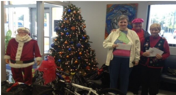
Shown above are two pictures of the Christmas Outreach committee in action in Christmases Past.